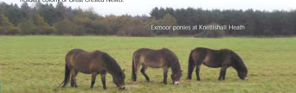
Exmoor ponies at Knettishall Heath