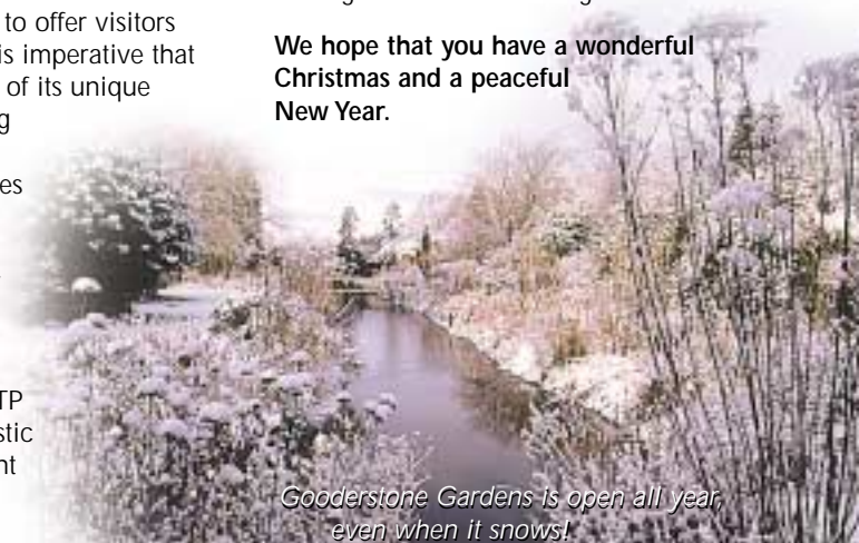
Gooderstone Gardens is open all year, even when it snows!

We hope that you have a wonderful Christmas and a peaceful New Year.