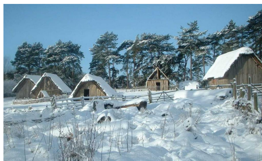
A wintery scene at West Stow Anglo-Saxon Village.