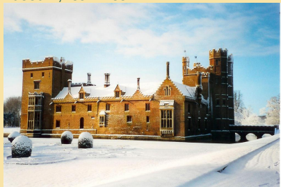
Oxborough Hall in the snow.